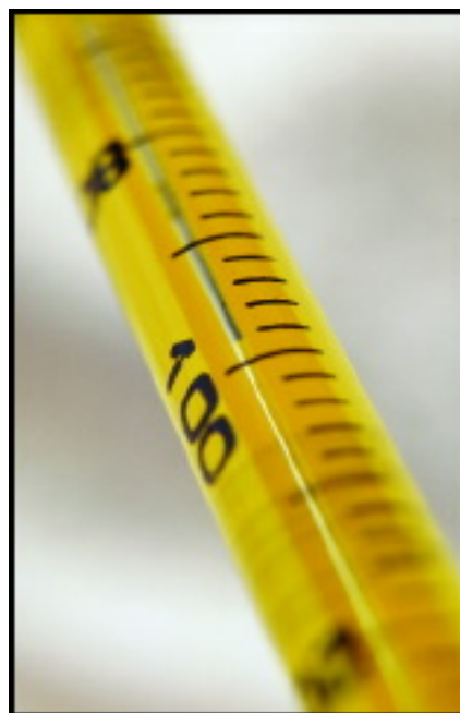
Fig. 2: Mercury thermometer (NIST)

However, even if you do everything correctly and have the best measuring device manufactured, your measurement will still not be absolutely accurate. The reason for this is because of the precision of your measuring device, which refers to how repeatable your measurement is. No device made can measure a quantity to infinite precision. For example, look at a thermometer (Figure 2). There is a