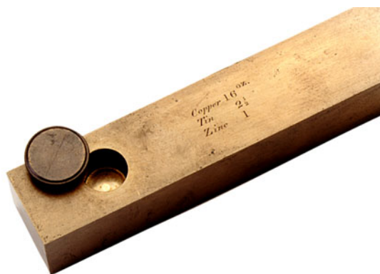
Fig. 1: Bronze yard No. 11 (NIST)

Take a minute and look around you at the variety of objects in your environment. There are probably a few pens or pencils, a notebook or two, assorted computer equipment, and other things. While you may be able to easily distinguish the differences between some objects (e.g., your notebook is longer than your pen), other differences are more difficult to discern. You may not be able to easily determine, for example, whether your computer keyboard or your course textbook has greater mass. Even when we can distinguish differences, it is not always easy to determine the extent of those differences. You may have noted that your computer monitor is heavier than your notebook, but is it twice as heavy or three times as heavy? Using only our senses, we cannot be certain about the answer, so we must take measurements.